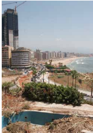
LEFT: BURJ FALASTEEN/FALASTEEN TOWER, AL BIRAH/RAMALLAH. RIGHT: LAST DAYS OF CARLTON, BEIRUT, HANGAR